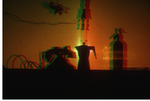
Figure 11 'The Miracle of the Shadows' The reverse of the screen

8. L.-B. Alberti On Painting (trans. Cecil Grayson), Harmondsworth: Penguin 1991. See Book I, section 12 (p48) and more specifically, section 19 (p54): "First of all, on the surface on which I am going to paint, I draw a rectangle of whatever size I want, which I regard as an open window through which the object to be painted is seen."