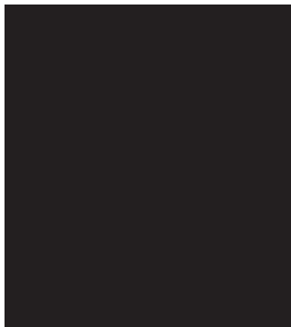
Figure 39 Abraham Bosse The Masters of Perspective 1648

three dimensional clue or cue - the boat - is so far away from the photographer that the space it defines is ambiguous to say the least. It is almost a kind of non-stereo view, one of those cards which would perhaps have been quickly discarded in the stereo enthusiast's mania for effect . Its effect is essentially contrary or blank and to this blankness, Duchamp added his pencil drawings of the diamond construction. Again, the drawings are at different distances from the edge of the respective photographs so that when viewed through a stereoscope, the construction is projected in front of the picture plane into real space with the seascape receding into pictorial space. The added drawing, moreover, is not stereoscopic in itself as the left and right versions are not constructed perspectively from two viewpoints. Had this been the case, two subtly differing aspects of the object would have been produced which could then be viewed to full stereoscopic effect. The drawings' perspective, however, does not imply disparity in viewpoint and so when viewed stereoscopically, there is no additional spatial quality to the drawing itself. It appears flat in the sense of a theatrical stage scenery flat. The only disparity or non-convergence is lateral, that is, Duchamp has simply placed the otherwise identical drawings at different positions from the edges of the respective photographs, hence the drawing's projection out of pictorial space and into the viewer's space.